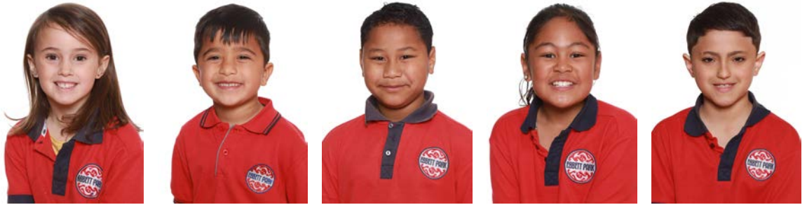
Rangirereata Room 6

These students earned the most Classdojo points in their classroom during the week.