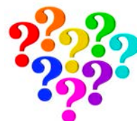
Term Two Winner