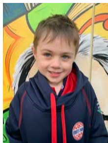
Asher Room 6

These students earned the most Classdojo points in their classroom during the week.