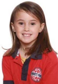
Sienna Room 5