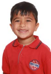
Tayton Room 7