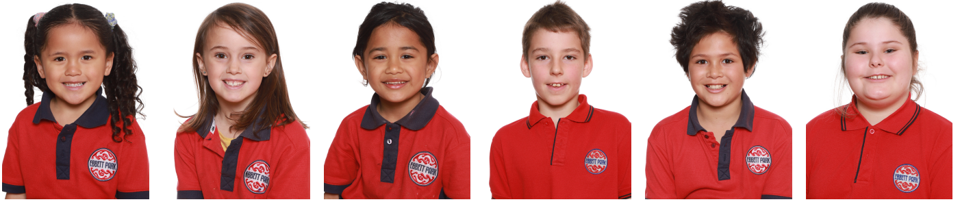
Thea Room 6

These students earned the most Classdojo points in their classroom during the week.