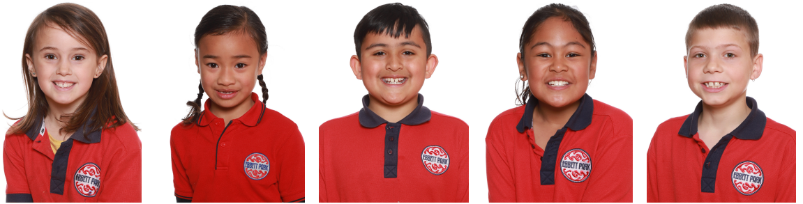
Kaianaki Room 6

These students earned the most Classdojo points in their classroom during Week