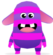
Week Two RONGO