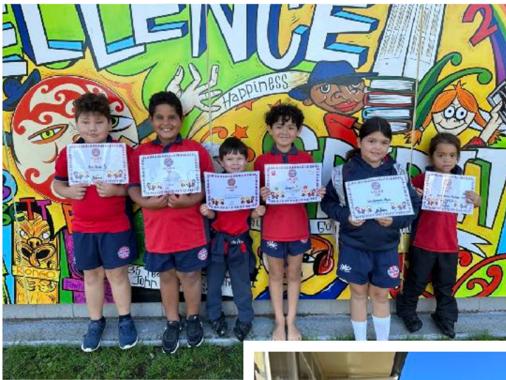
Room 5: Hookioi