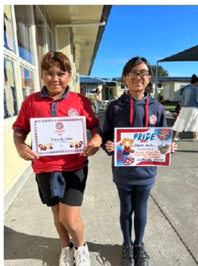
Room 5: Away