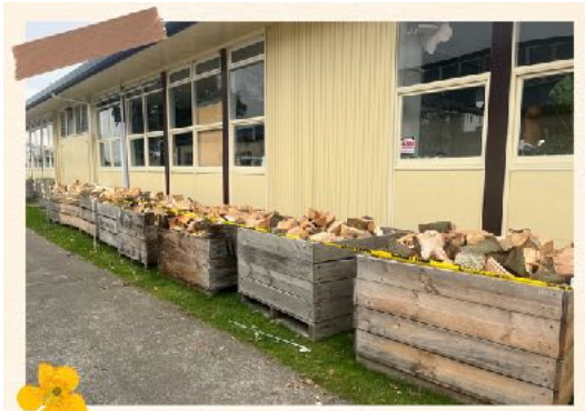
FIRE WOOD - OAK - $120BIN