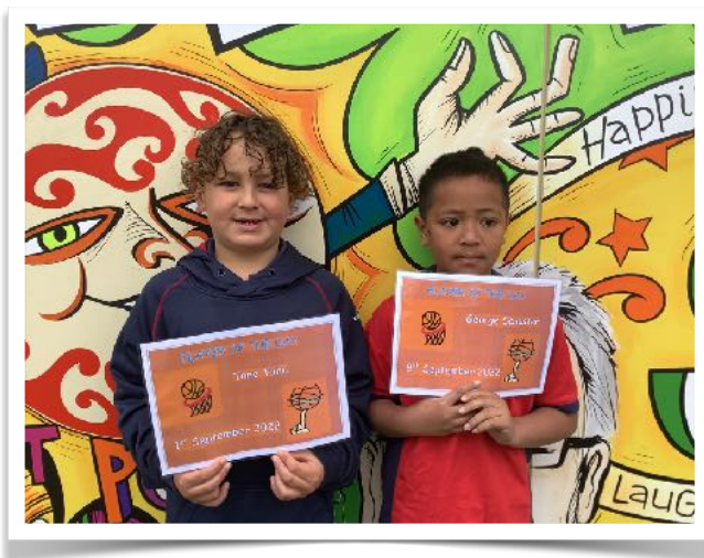
Players of Day for Basketball week 6 and 7