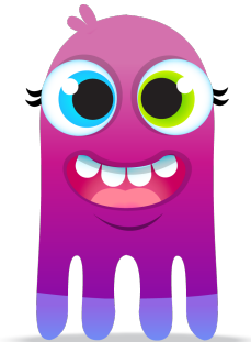
Week Five Tawhirimatea