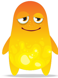
Week Six Rongo