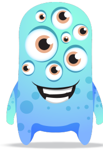
Week Seven Tangaroa