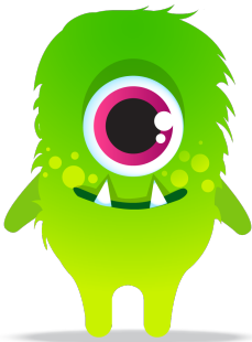
Week One Tane Mahuta