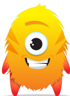
Week Five Rongo