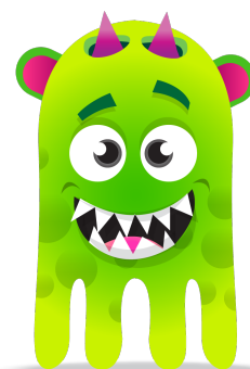
Week Four Tane Mahuta