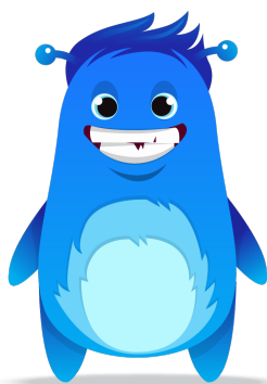
Week Two Tangaroa