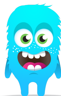
Week Eight Tangaroa