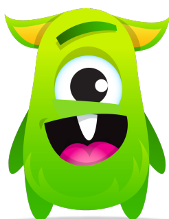
Week Ten Tane Mahuta