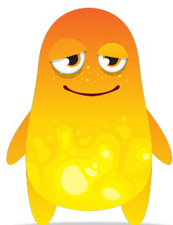
Week Six Rongo