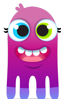
Week Seven Tawhirimatea