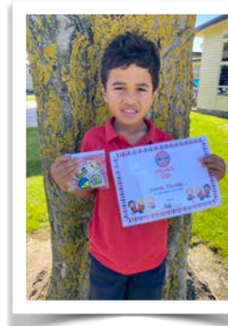
Noema - Our Room 7 PB4L VIP.