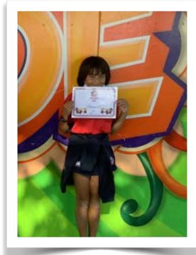
Moko - Our Room 9 PB4L VIP.