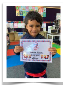
Westbrooke - Our Room 4 PB4L VIP.