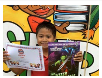
Mua - Our Room 8 PB4L VIP.