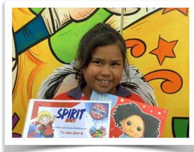
Echo - showing spirit by always doing her best.