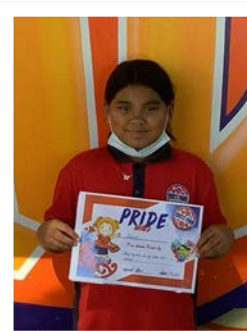
Eternity - showing pride for always giving 100% in her work.