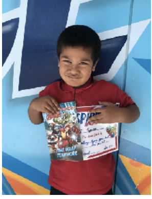
Showing our School values: Excellence, Pride and Spirit.