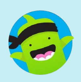
ClassDojo A free app we use to reward students and an easy way to communicate with