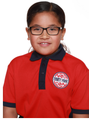
Mahina Room 5