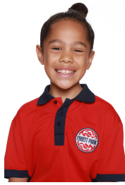
Sariyah Room 3