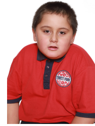
Preciouz Room 6