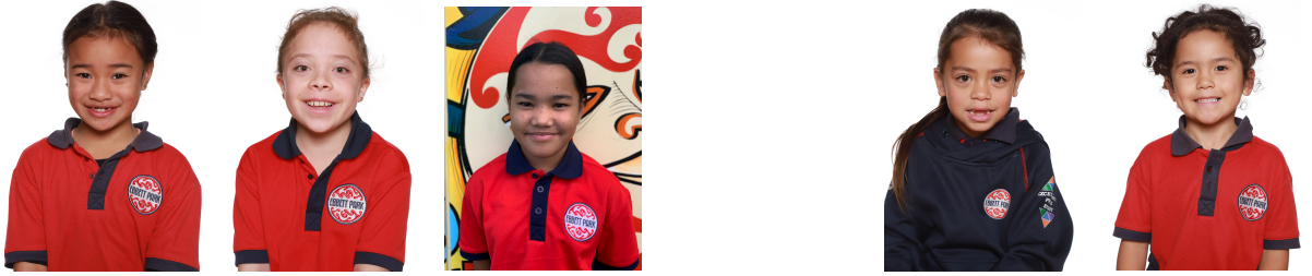
Dynesty Room 2

These students earned the most Classdojo points in their classroom during the week.